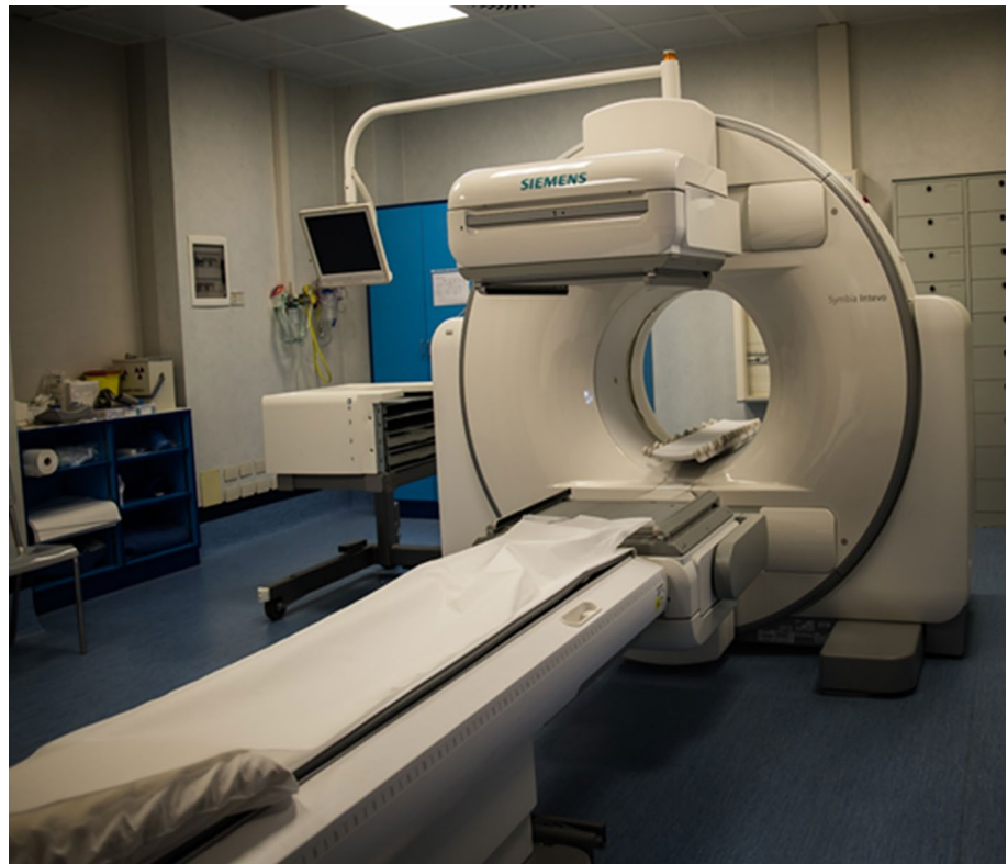
Fig. 3 Example of SPECT/CT system