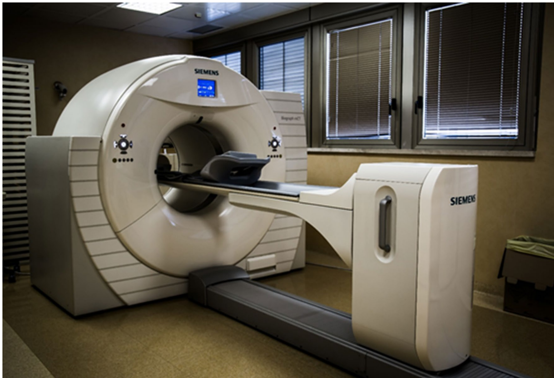
Fig. 4 Example of PET/CT system