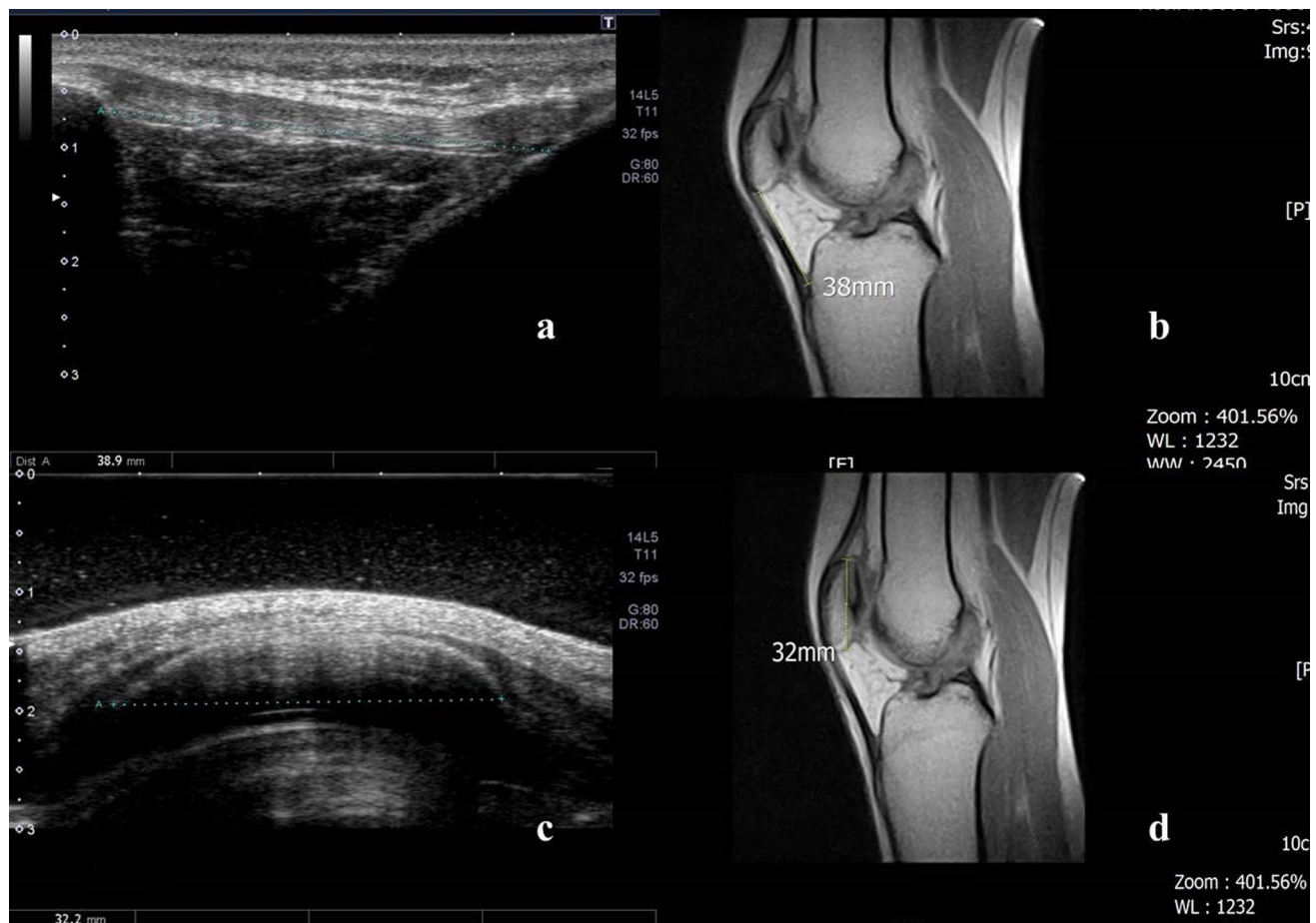
Fig. 1 A 31-year-old football player with anterior knee pain. a Patellar tendon measures 38.9 mm on US image and b 38 mm on mid-sagittal non-fat-saturated T1-weighted spin echo. c Length of patella

All patients underwent MRI (Artoscan 0.2 T, C-Scan Esaote, Genoa, Italy) examination in the same US session. The images were obtained with a knee flexion angle of 30° using a specific support [3, 10]. The scanning parameters were set as follows: the repetition time (TR) and echo time (TE) of sagittal T1-weighted spin echo, axial T2-weighted spin echo, coronal gradient echo-short time inversion