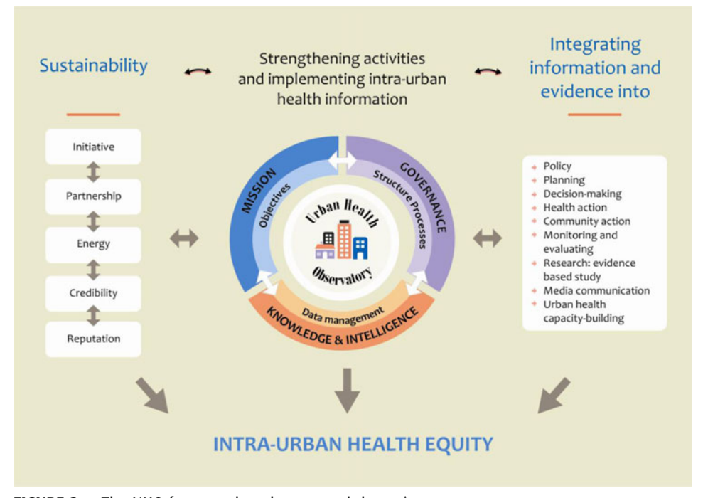
FIGURE 3. The UHO framework and contextual dynamics.

UHO legitimacy begins with the partnerships developed and the intelligence gathered by the UHOs in their production of knowledge. As knowledge for political action is produced, as partnerships with diverse social agents (principally public officials but also key civil society members) are established, and as the data and subsequent interventions are recognized as appropriate, the legitimacy of the