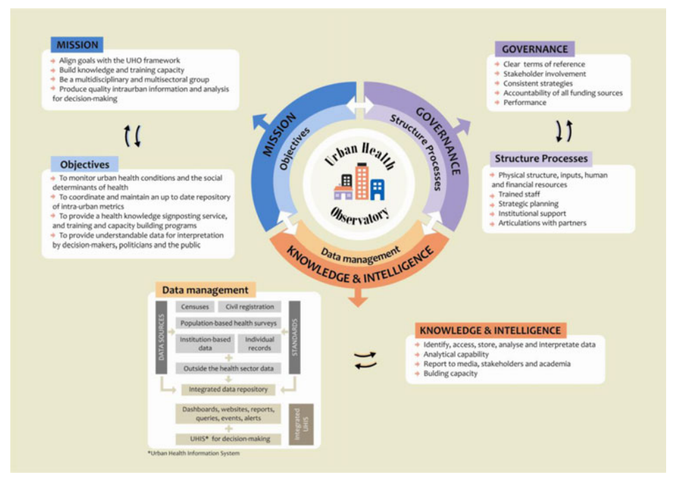
FIGURE 2. Re-defined framework proposed for UHOs.

local health agenda and a political momentum that facilitated the circumstances for creation and for sustainability. The UHOs established in high-income countries were designed and managed in a high-demand environment facilitated by financial and institutional support from the local government. For the rest, one was nested in an academic environment (OSUBH in Belo Horizonte), another was created by demand from civil society (BUHN in Dhaka), and for the others, external funding was essential to the implementation phase.