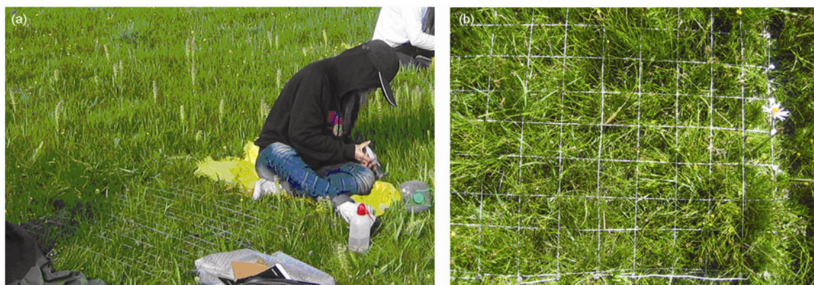
Figure 1 ^{15}\text{N} injection plot in Kobresia humilis alpine meadow.