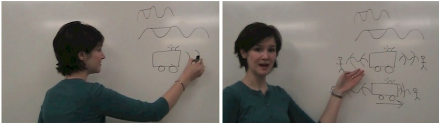
Fig. 1 Screenshots from a video lecture on the Doppler Effect with the instructor drawing as she lectures (left panel) or pointing to already drawn illustrations (right panel)