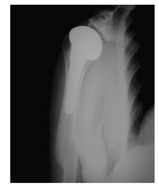
Fig. 2. Mini-stem humeral component used in the setting of a humeral shaft malunion

in the preoperative holding area before surgery and again each day during their hospitalization. Constant–Murley scores and UCLA shoulder scores were recorded at final follow-up, as was postoperative range of motion. Radiographs were taken to document implant position and any abnormalities. The follow-up was a minimum of 2 years and averaged 29 months (range 24–43 months).