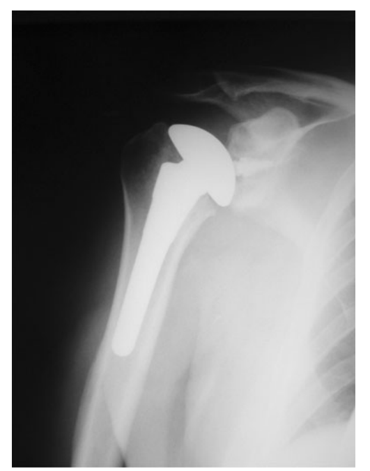
Fig. 5. Post-op AP radiograph showing mini-stemmed humeral component placed in varus

This is the first report to document the efficacy of smallstemmed humeral components for the use in shoulder arthroplasty. The success of total shoulder arthroplasty for primary osteoarthritis is well documented and has been shown to give more predictable pain relief and functional outcomes than hemiarthroplasty and partial or full surface replacement with or without biologic glenoid arthroplasty. In this study, the use of mini-stem humeral components has provided good to excellent results and improved range of motion after minimum 2-year follow-up. While our current study design cannot provide a direct comparison to conventional total shoulder arthroplasty, we found that postoperative Constant–Murley and UCLA scores, active elevation and