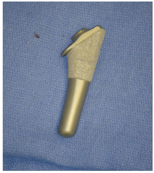
Fig. 1. Mini-stem humeral component

This study retrospectively reviewed the first 49 mini-stem shoulder replacements (47 patients) for primary osteoarthritis. There were 26 female and 23 male patients. The average age was 67 years (range 46–83 years). All patients were evaluated at a minimum 2-year follow-up. Visual analog scores were recorded at the final preoperative visit or