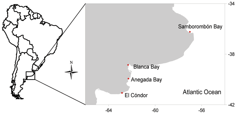
Fig. 1 Map showing the different localities invaded by the Japanese oyster Crassostrea gigas on the coast of Argentina

while invasive species are considered among the top-five threats to native biodiversity (Vitousek et al. 1997; Sala et al. 2000), their arrival in the environments could lead to an increase in local richness.