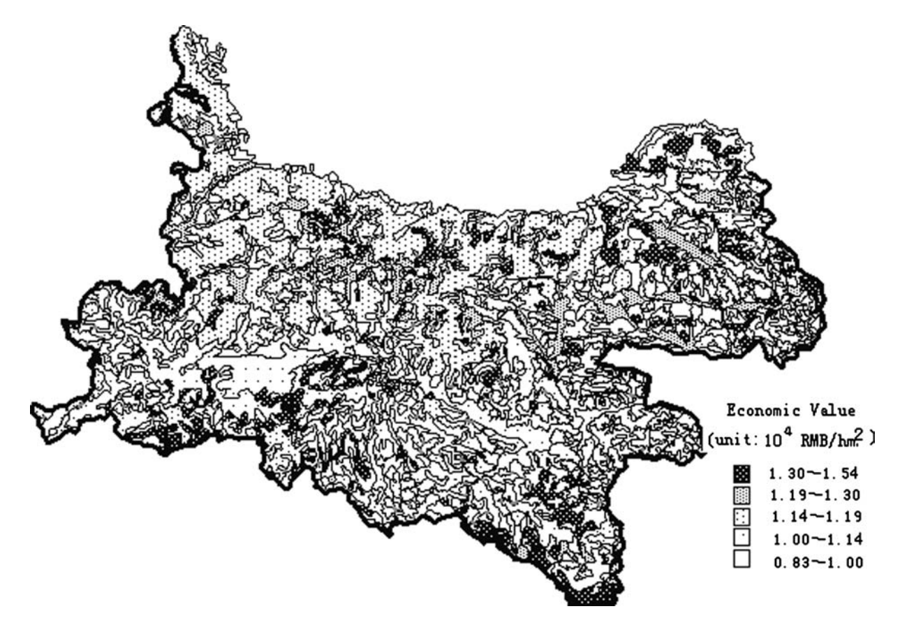
Fig. 3 The spatial distribution of economic values of terrestrial ecosystem services in Qinba mountains

high mountains, meadow grassland, gramineous meadow, temperate fruit trees in loess soil, warm temperate deciduous fruit trees and fruit trees on the northern foot of Qin ling are all <1%. The contribution of the other types of vegetation rest varies between 1 and 10%.