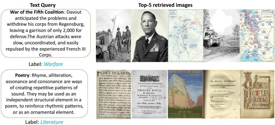
Figure 2 Typical examples of the Text2Img task obtained by our proposed DAML on Wiki dataset with CNN features. In each example, the text query and the top five images retrieved are listed in the following columns

We further investigate the effectiveness of the cross-modal representations learned by our DAML. In particular, for each of the image and text modality we randomly choose 1000 transformed features in the test set to form a total of 2000 features. The chosen features do not necessarily form image text pairs. We then use t-SNE to visualize the distribution of these features.