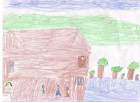
Fig. 6 A witch lives in the jungle