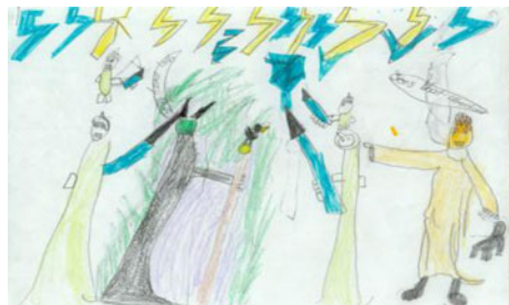
Fig. 7 The King and his pet