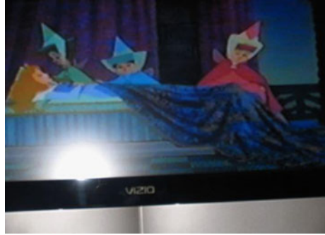
Fig. 1 Aurora and the three fairies

kindhearted Good Fairies, magic, evil, witch, hardship, sadness, slumber, dragon and sleeping beauty. The students brainstormed on the meanings of the words and I asked them to make an educated guess of their meanings and write their answers on their worksheets. They later shared this with the class.