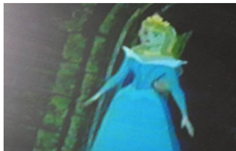
Fig. 2 Aurora and the three fairies

The students watched the video for two lessons (weeks two and three) because it ran for 90 min. The teacher stopped it periodically for students’ comments. Later I modeled the analysis of Fig. 2 in terms of color, physical appearance, and overall message of the frame. During week four, the teacher replayed the video while the students watched it and also worked on the questions posted on the screen through an overhead projector: (a) What do you think the maker of Sleeping Beauty wants you to learn from it? (b) Who are the important characters in the story? (c) Who makes important decisions in the video? (d) Who do you like in it and why? (e) What does the look of Aurora mean to you? (f) Should all girls look like this?