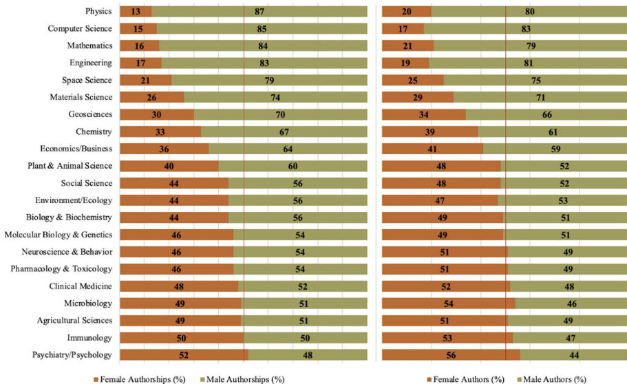
Fig. 1 Percentage of male and female authorships and authors from Russia in 21 research fields in 2017–2019

Figure 1 also compares the percentage presence of men and women authorships and authors from Russia. For each research field, it shows that women authors presented better