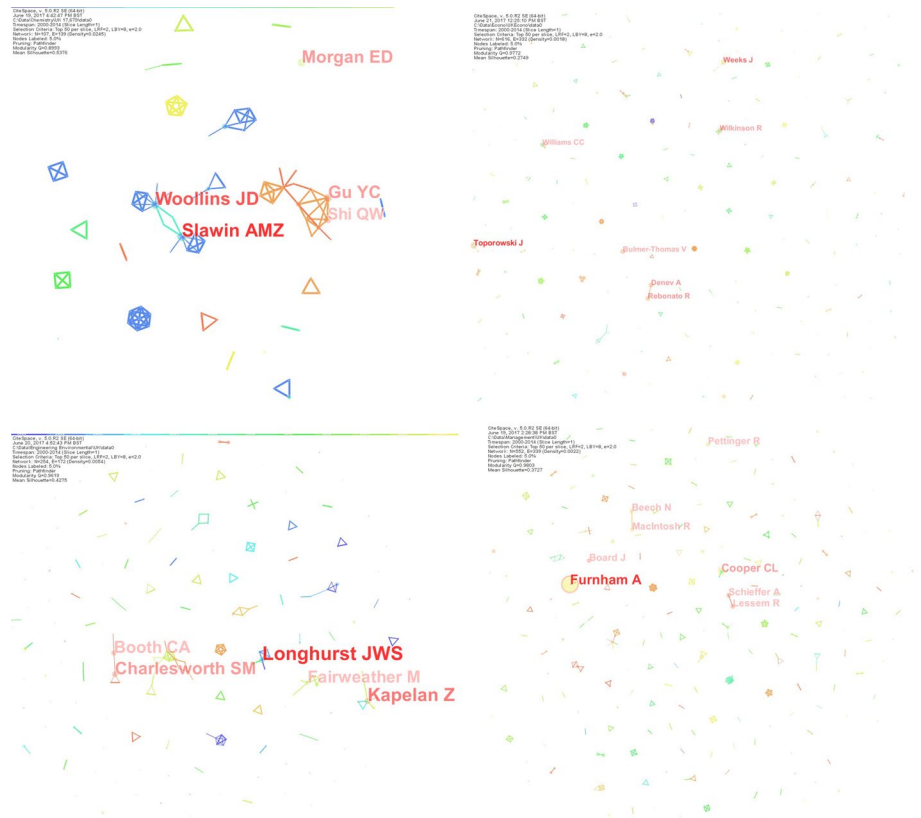
Fig. 4 The co-authorship mapping from uncited UK publications for Chemistry Organic (upper-left), Engineering Environmental (lower-left), Economics (upper-right) and Management (lower-right)

paths passing through that node. While some of the parameter values differ little between countries or between cited and uncited networks, others support the view that the Chinese networks differ markedly from their American and British counterparts. For example, the numbers of authors with non-zero centrality in the largest community, where the Chinese uncited values are much larger than the other two values across all four disciplines. Again, both the percentage of authors in the largest community and the mean centralities are larger, and the percentage of singleton communities smaller, for China in the sets of both cited and uncited publications.