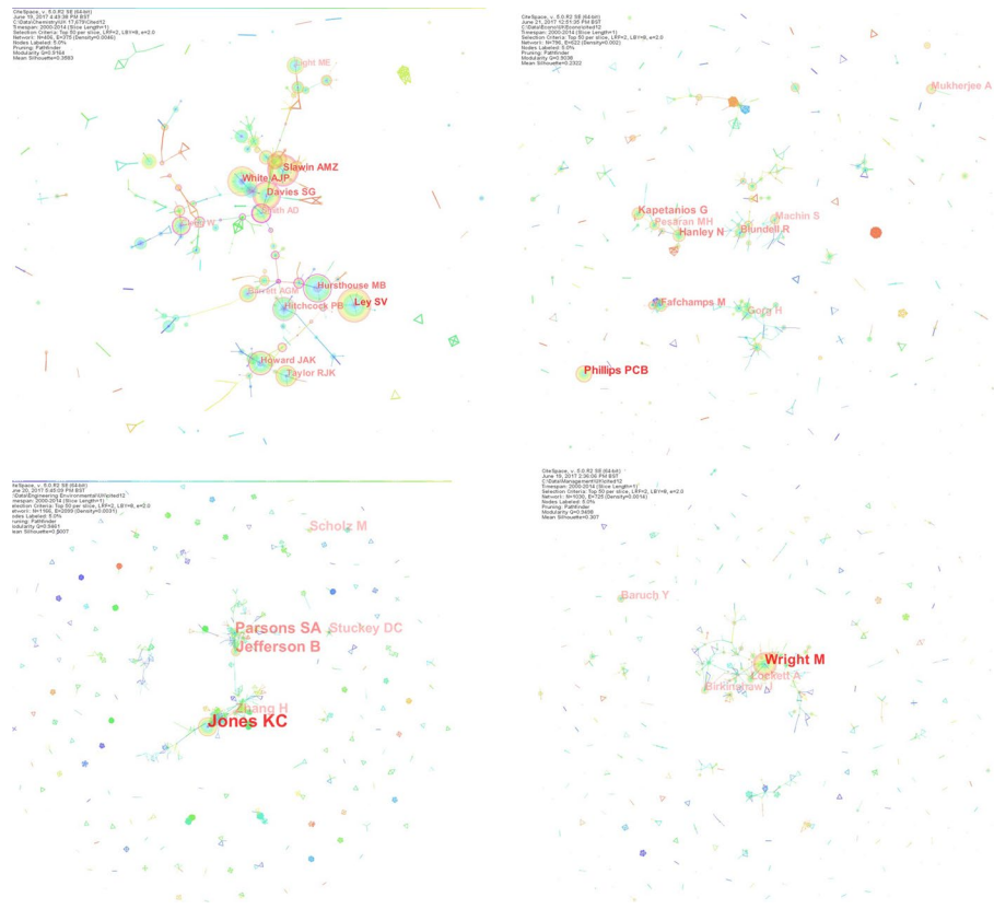
Fig. 6 The co-authorship mapping from cited UK publications for Chemistry Organic (upper-left), Engineering Environmental (lower-left), Economics (upper-right) and Management (lower-right)

the results for the two types of Chinese network differ considerably from those for the other two countries. Collaboration—whether at the institutional, national or international level—has long been recognised as an important factor in the ability of a research publication to attract citations. It might be hence expected that there would be greater evidence of collaboration in cited, as against uncited, publications. The co-authorship networks considered in this paper have demonstrated that this is certainly the case for USA and UK publications in four disparate research disciplines, since there are significant differences in structure between the cited and uncited networks. The former are characterised by a single, extended community involving a large fraction of the total sets of productive authors, together with a large number of much smaller, or even singleton, components; whereas the extended community is absent from the latter. There is some degree of variation in the precise figures but this is hardly unexpected given the very different ways in which disciplines are organized in the physical sciences, engineering and the social sciences, and the differences are small when compared with the corresponding results for the Chinese researchers.