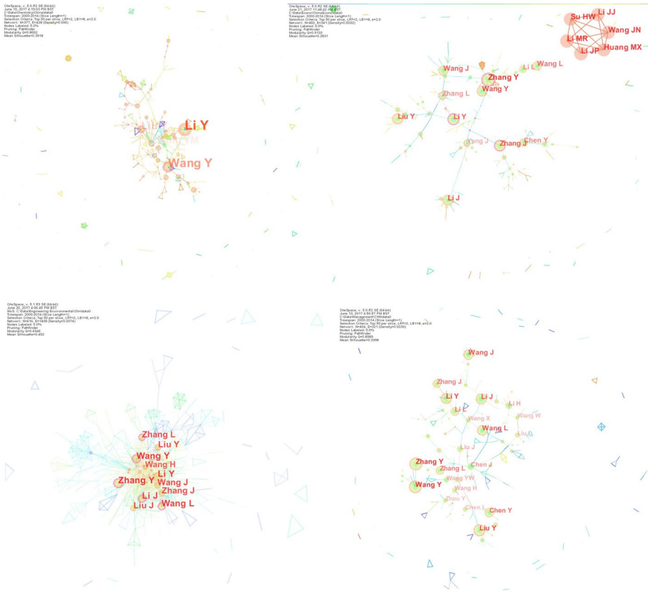
Fig. 3 The co-authorship mapping from uncited Chinese publications for Chemistry Organic (upper-left), Engineering Environmental (lower-left), Economics (upper-right) and Management (lower-right)

the USA and UK uncited networks, whereas the three sets of cited networks are comparable in structure. It also makes clear that, in most cases, the majority of the authors are in small or singleton clusters, as would be expected given the power law behaviour of co-authorship networks first noted by Newman (Newman 2001b, 2004). A \chi^2 analysis of the data in Table 5 is detailed in Table 6, each cell of which contains the \chi^2 value and the associated probability of a significant difference ( \nu=3 ) between the distributions of family sizes for the uncited and cited networks. There is no significant difference, at the 0.05 level of statistical significance, for two of the Chinese datasets, those for Engineering Environmental and Management, and the difference is only marginal ( p=0.049 ) for Economics. That is completely different from all USA and UK datasets.