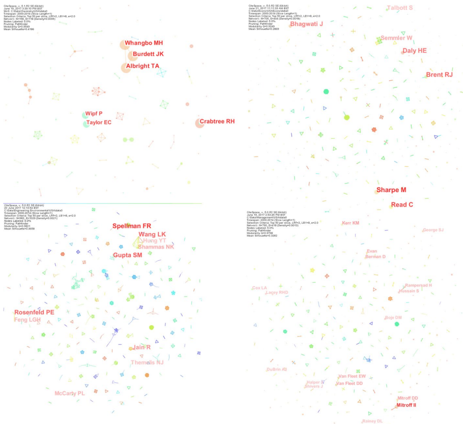
Fig. 1 The co-authorship mapping from uncited USA publications for Chemistry Organic (upper-left), Engineering Environmental (lower-left), Economics (upper-right) and Management (lower-right)

Inspection of the four networks in Fig. 1 show that they all exhibit a comparable structure in which there are large numbers of small families (the largest being a single Engineering Environmental grouping containing 24 members). For example, the network based on the uncited USA Chemistry Organic publications contained 158 productive author nodes and 118 co-authorship links: these yielded a total of 36 families containing between 2 and 7 individuals, with the remaining 47 productive authors unlinked. The ratio of the number of links to the number of nodes is 0.75, with the corresponding figures for Economics and Management being 0.63 and 0.53, respectively; that for Engineering Environmental is 1.05, representing a more highly linked structure than for the other three disciplines. However, it will be clear that in all networks, the great majority of the families consist of just two or three authors. Figure 2 and Table 4 describe the corresponding networks based on the cited publications. It will be seen that the structures here are very different: while there are again many small, two-or three-membered communities, all four networks are dominated by a single, enormous community, a sort of extended research family: that for Economics contains 97 authors while those for the other three disciplines all contain over 200 authors.