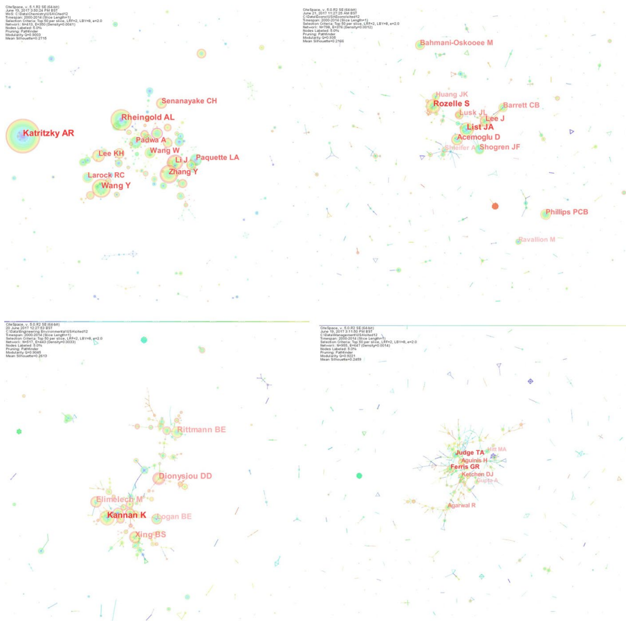
Fig. 2 The co-authorship mapping from cited USA publications for Chemistry Organic (upper-left), Engineering Environmental (lower-left), Economics (upper-right) and Management (lower-right)

UK networks are similar to those for the USA in that the uncited ones (Fig. 4) again consist of many small communities while the four cited ones (Fig. 6) are each dominated by a single, extended research family. This is also the case with the four networks based on the Chinese cited publications in Fig. 5. Where the Chinese networks differ are when the uncited publications are considered (in Fig. 3) since these all have the single, very large community that otherwise characterises the various cited-publication networks.