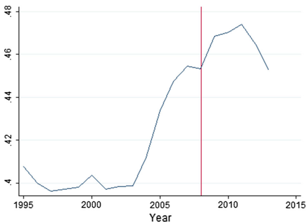
Fig. 2 Emancipation rate by year for those aged 18–40

One may suspect the increase in the emancipation rate during the recession as the result of a dominant secular trend. This is unlikely as the secular trend was the decreasing emancipation rate during the last several decades of the twentieth century mostly due to the increase in schooling during the same period (Vieira and Gamundi 2010) and the schooling enrollment in Spain has stayed virtually constant during the last decade. Furthermore, as seen in Fig. 2, the emancipation rate shows a downward movement since 2012. When we included time trend (both linear and quadratic terms) in our estimation, it turned out insignificant and almost no changes are observed in the estimates of other variables. In any case, we will have to wait to examine the possibility of a reversed secular trend.