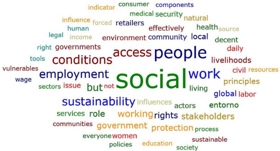
Fig. 1 Cloud of words based on the interviewees' language

Once having set the codes and categories, a series of networks connecting them were necessary to understand the data. Finally, the analysis concludes with the exhibition of results in Sect. 4 through an extensive narrative (Johnson 2015). As the software provides the option of “memos”, they were used to make relevant and important annotations for the analysis of the data.