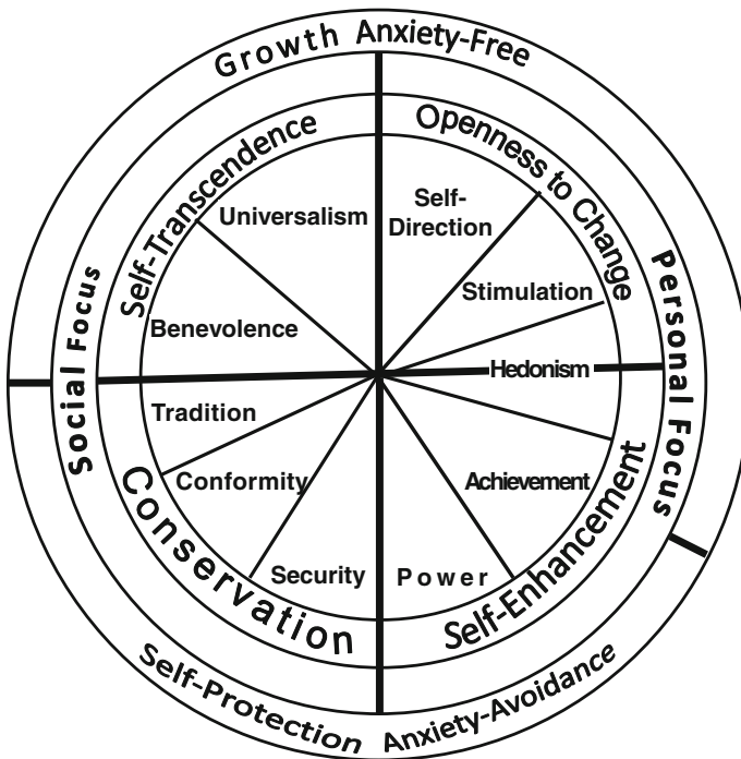
Fig. 1 The motivational continuum of 10 basic personal values with two summary dimensions and underlying orientations

We note additional sources of the circular structure of basic personal values that aid in developing hypotheses about the ways basic values are expressed in core political values. Values in the bottom half of the circle (Fig. 1) are based in the need