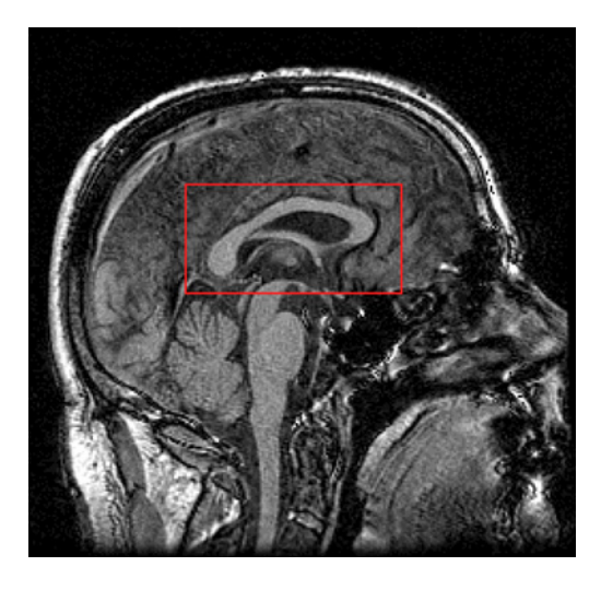
Fig. 1. A mid-sagittal slice of the brain. The area containing the corpus callosum, the large white C-shaped structure, is outlined.

which vary depending on the cortical destination and the degree of myelination of the fibers. If "function follows form, then there are a variety of callosal functions" (Chiarello, 1995, p. 177) and a variety of ways in which interhemispheric communication can take place. These ideas are interesting and challenge the concept that the corpus callosum serves the sole function of "uniting" the cerebral hemispheres. Research exploring these concepts, however, is frought with challenges.