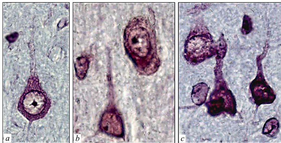
Fig. 1. Neurons in layer III of the frontal cortex of the rat brain. a ) Control, 10 days after sham operation; b, c ) day 10 of cholestasis (partial lysis of chromatophilic substance and hyperchromatosis). b ) Hyperchromic shrunken neurons with corkscrewed apical dendrites; c ) satellitosis. a, b ) Nissl staining; c ) stained with hematoxylin and eosin. Digital microphotography. Magnification ×800.

Me – median; IQR – interquartile range. Here and in Table 2: * p < 0.05; ** p < 0.01 compared with controls.