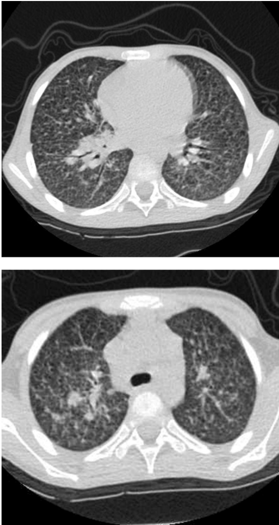
Fig. 1 A chest computed tomography scan showed extensive fine-grained shadows in both lungs, with cavitation in the upper lobe of both lungs and hilar enlargement

With antituberculosis and antibiotic therapy, the boy still presented with recurrent fever, and the alanine aminotransferase (ALT) level was elevated to 97.5 U/L, indicating the impairment of liver function. Isoniazid and levofloxacin were withdrawn, and the anti-infection treatment was upgraded to imipenem on 6 January. However, his clinical condition further deteriorated. He developed respiratory failure and required mechanical ventilation. He was transferred to the intensive care unit on 6 January. On 6 January, his total white blood cell count had fallen to 3.82 \times 10^9/L , red blood cell count was 2.85 \times 10^{12}/L , hemoglobin