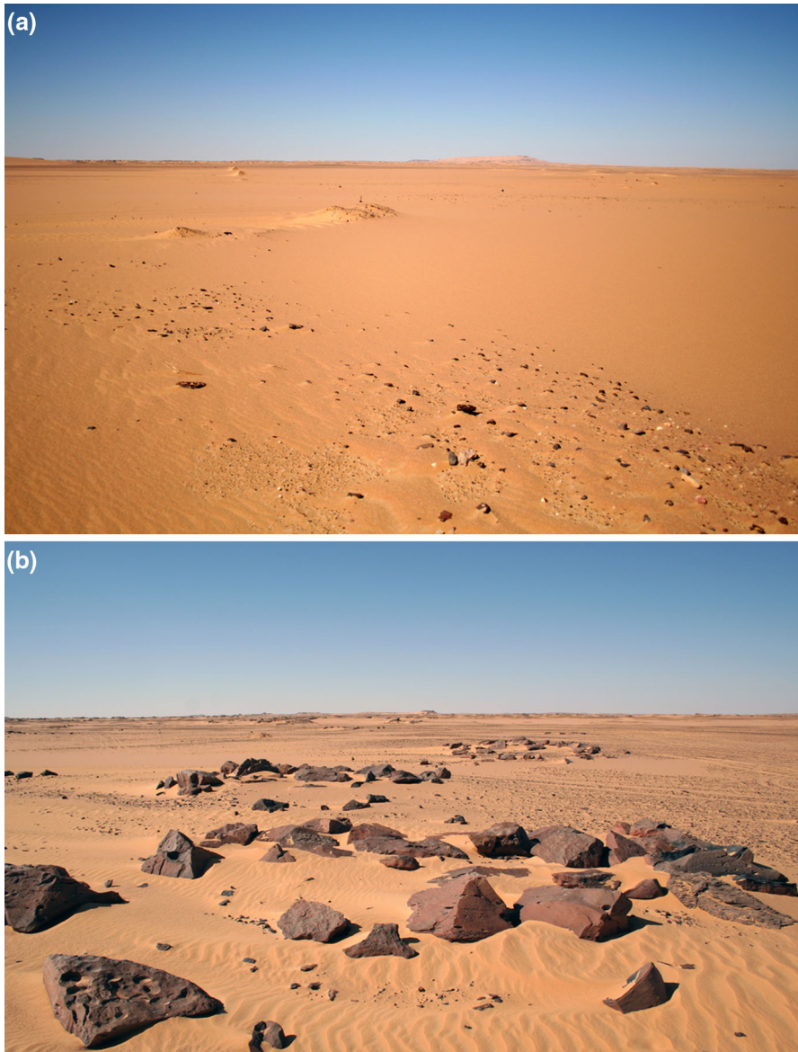
Fig. 2 Modern landscape views at Nabta Playa a from E-75-6 and b valley of the stelae.

Remnants of the ancient shore lines have been found at El Gebel El Beid Playa to the Northeast of Nabta Playa, the Kiseiba escarpment and other playa basins: ‘The formation of some of the Bir Kiseiba playas can probably be related to the truncation of the land surface by deflation almost to the level of the water-