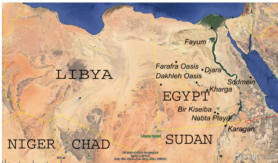
Fig. 1 Map of Northeast Africa showing the location of the major sites mentioned in the text

The independent African domestication model has been extensively debated since 1980 (Brass 2007, 2013; Clutton-Brock 1993, Di Lernia 1999, 2004, 2013; Gautier 1984, 2001; Marshall and Hildebrand 2002; Riemer 2007; Smith 1984, 1986; Stock and Gifford-Gonzalez 2013; Wendorf and Schild 1994; Wendorf et al. 1984, 2001). The arguments have traditionally revolved around the criteria for determining domesticated status. Di Lernia and Smith have also underlined