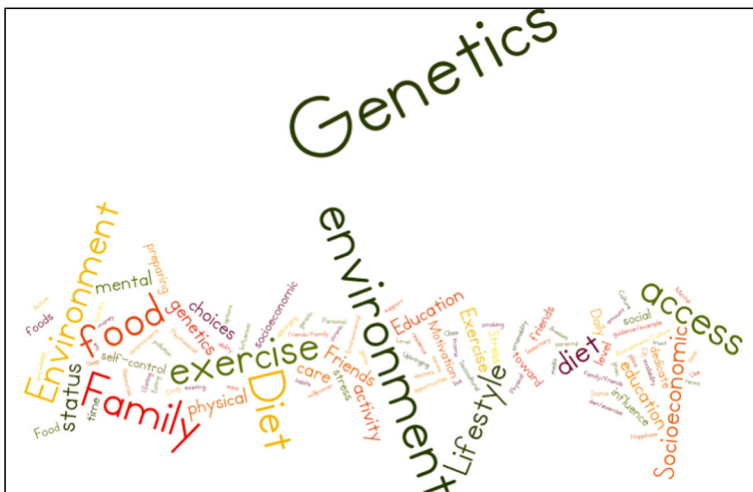
Fig. 2 Word map of premed majors’ open-ended response to “What are the three most important influences on people’s health?”. Data are from 155 seniors who responded to a spring 2015 survey about the pre-health professional curriculum

literacy, health traditions and beliefs, physician bias) (Association of American Medical Colleges 2005), individual-level factors (genetics, individual lifestyle choices), and structural competency factors as defined by Metzler and Hansen (2014) (access to healthcare, health delivery system, insurance, institutional racism, medicalization, income, neighborhood, social policies). MHS majors were more likely to select one or more cultural factors (MHS: 75/85[89%]; premed: 55/70 [54%], p < .05 ) and less likely to select one or more individual-level factors (MHS: 25/85[29%]; premed: 34/70 [49%], p < .05 ) as one of the three most important factors explaining why childhood obesity rates are highest in the U.S. South (Table 4). MHS majors were also more likely than premed majors to select one or more structural factors