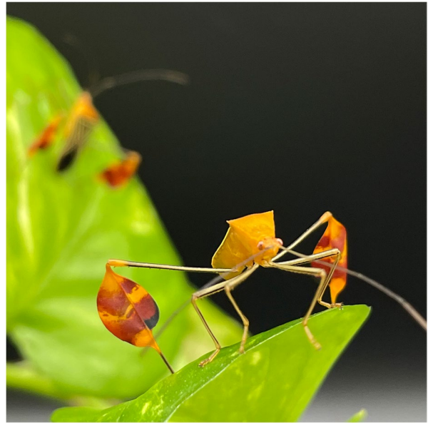
Fig. 1 The matador bug, Anisoscelis alipes , has large conspicuous tibial plates on both hind legs with which they perform a stereotyped waving behavior, yet nothing is known about the selective pressures that shape these traits.

evolutionary labile trait evolves through sexual selection (Mitchell 1980; Eberhard 1998; Miyatake 2002; Miller and Emlen 2010). Additionally, the matador bug has been frequently observed performing a stereotypic “waving” behavior with these hind legs (U. Somjee, pers. obs. ) that we detail in this paper. This specific flag-waving behavior has not been formally described to the best of our knowledge.