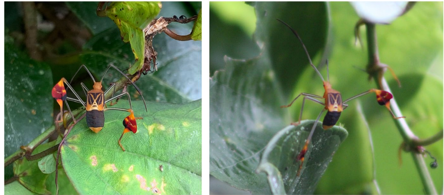
Fig. 4 Late instar (5 th instar) matador bug nymphs, Anisoscelis alipes , bear colorful tibial flags and display “flag waving” behavior. This is consistent with the hypothesis that this morphology and behavior plays a role in predator defense

(Poulton 1890; White and Umbers 2021). A. alipes appear to have considerable individual variation in color proportion and pattern, and likely sequester toxins from their host plants, usually cyanogenic passifloras (Aldrich and Blum 1978; Aldrich 1988). In addition, A. alipes produce an odorous volatile compound when disturbed (U. Somjee, pers. obs.). Collectively these findings suggest that these traits could function as aposematic signals, offering a non-mutually exclusive alternative to the predator lure hypothesis.