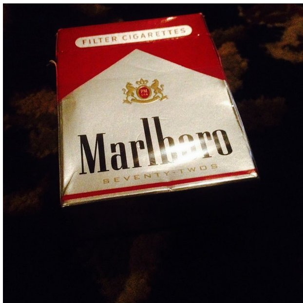
Fig. 5 Photo of a cigarette box elicited discussion about the harmful effects of smoking on health