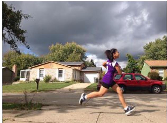
Fig. 7 Photo of a participant's sister running elicited discussion about physical activity as a positive influence on health