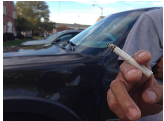
Fig. 4 Photograph of a cigarette that led to a discussion about high consumption of tobacco and cigarettes in the Burmese community as perceived by the participants

The adolescents considered processed or 'microwavable' food as unhealthy, albeit convenient. The participants described major changes in their diet after resettlement. In