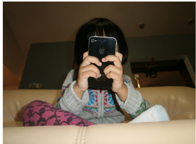
Fig. 6 Photo of a participant's sibling using a smartphone elicited discussion around technology's impact on the adolescents' lives