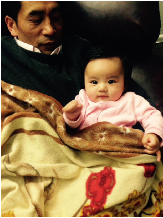
Fig. 2 Photograph of a baby with grandfather that elicited a conversation around feeling safe with family: “The child looks like he is happy because he feels safe.”

speak the language anymore, she’s upset because she feels like we don’t tell her much.