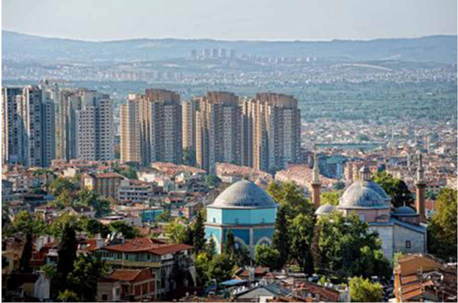
Fig. 1 TOKI Doğanbey high-rises dominating Bursa's skyline

in the following decade. As we will discuss shortly, both this method and this particular form of subjectivity were important in the regeneration of Doğanbey.