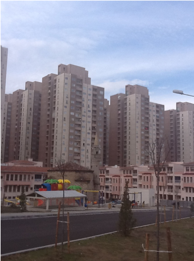
Fig. 5 Current view from the site

another after 2004. These changes aimed at the deregulation of the legal and institutional framework of urban planning and existing bureaucratic control mechanisms over development (Balaban 2012). The outcome was increased autonomy for developers in private sector as well as TOKI itself, which from then on acted as a profit-oriented actor (Özdemir 2011; Batuman 2013). Land-use plans were revised and/or renewed to encourage market-driven redevelopment. Here, urban design was deployed as an instrument to achieve piecemeal projects, to which the plans were later adapted. As we have pointed out above, the stages of the renewal process in Doğanbey reveal the role defined for urban design within TOKI's renewal mechanism. Here, it is reduced to the physical expression (massing) of the economic model and developed without any deliberation with other stakeholders. Contrary to its current practice in Turkey, we argue that urban design can and should serve as a key instrument to develop a holistic approach to the process of urban regeneration, which, rather than prioritizing profit, should be understood as a comprehensive action in the face of urban decline (Roberts and Sykes 2000).