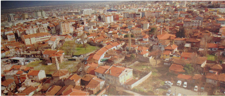
Fig. 2 Doğanbey urban renewal zone before the process