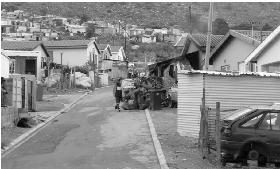
Fig. 3 Evidence of home-based economic activities in formalised Imizamo Yethu housing

site-and-service provision. Official government housing waiting lists are used to select those to move into the new housing. Houses are state subsidised and supplemented by provision of additional and improved construction materials and fixtures from NMTT (in the region of R 10,000–20,000 per property) (Fig. 4). Additional costs above these subsidies are covered by the new residents, usually in the form of a favourable-term loan from NMTT. This process is based upon experience from other providers that such requirements often result in greater sense of ownership and investment in the property (interview with NMTT, 20 April 2009).