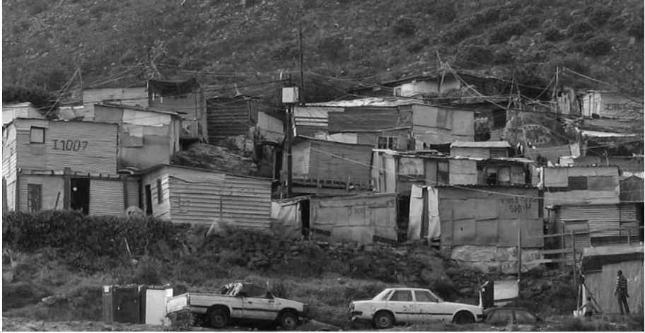
Fig. 2 Informal shack dwellings in Imizamo Yethu

site-and-service provision. Official government housing waiting lists are used to select those to move into the new housing. Houses are state subsidised and supplemented by provision of additional and improved construction materials and fixtures from NMTT (in the region of R 10,000–20,000 per property) (Fig. 4). Additional costs above these subsidies are covered by the new residents, usually in the form of a favourable-term loan from NMTT. This process is based upon experience from other providers that such requirements often result in greater sense of ownership and investment in the property (interview with NMTT, 20 April 2009).