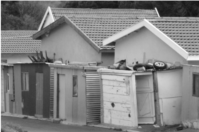
Fig. 5 Informal shacks adjoining formalised NMTT housing

of the selection procedure for NMTT residents, internal political conflict and frustration with the slow pace of change contribute to a fracturing of community. While many are supportive of the formalisation of housing, and note how some individuals have used their new housing for community benefits (by hosting homework clubs and similar), there is frustration that many have not offered such support and opportunity to other community members. Such perceptions and feelings reflect and exacerbate the daily struggles to survive.