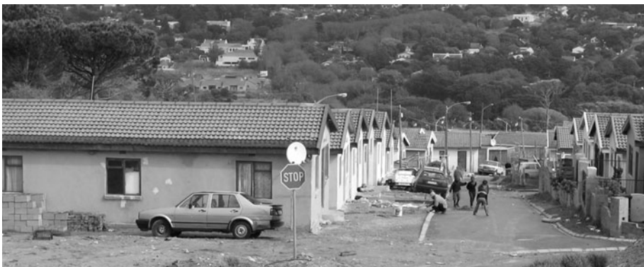
Fig. 4 NMTT housing in Imizamo Yethu

The association between housing and health is made complex by a host of confounding variables. In the first analysis stage descriptive statistics show the differences between the demographic variables for each group. The second stage involved bivariate analysis between the outcome variables of interest and socio-demographic variables to determine which variables should be controlled for in any multivariate analysis. Finally logistic regression models were ran to generate odds ratios predicting the probability of the dependent variable when considering a set of confounding factors. In this analysis sex, age and employment were controlled for in all models (sex and employment were entered as discrete variables (male, female and employed, unemployed. Age was entered as a continuous variable). Controlling for the variables did inevitably reduce the sample size of