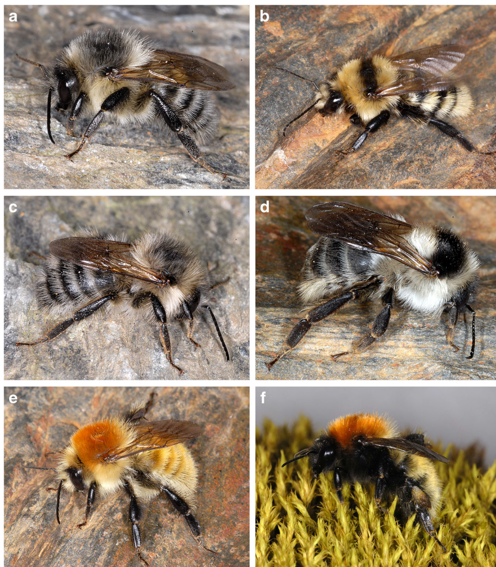
Fig. 1 a Bombus deuteronymus superequester from Mongolia. b B. filchnerae from Mongolia. c B. humilis subbaicalensis from Mongolia. d B. exil from Mongolia. e B. muscorum muscorum from The Netherlands. f B. muscorum liepetterseni from Norway.

In this study, the variability in CLGS of four East-Palaearctic taxa was investigated to question their role in the pre-mating recognition system: Bombus deuteronymus superequester (Skorikov 1914) (Fig. 1a), B. filchnerae Vogt 1908 (Fig. 1b), B. humilis subbaicalensis Vogt 1911 (Fig. 1c), and B. exil (Skorikov 1923) (Fig. 1d) all belonging to the Thoracobombus Dalla Torre 1880 subgenus. Moreover, we compared the CLGS composition of B. filchnerae with that of its nearest Palaearctic taxon: B. muscorum (L. 1758) (Fig. 1e, f).