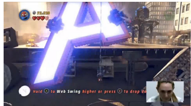
Fig. 1 Twitch feed capture

Participants without ASD ranged in age from 11; 11 to 20;1 years. All had receptive vocabulary scores at or above normal ranges, as indicated by standard scores in the range of 100–135 on the Peabody Picture Vocabulary Test-IV (PPVT-IV; Dunn and Dunn 2007. See Table 2 for additional demographic information for the typically developing participants. Matching across the groups of participants was based loosely on chronological age. Chronological age matching was attempted because the study aimed to inform future interventions that might use videogame play as a context for interventions targeting friendships among