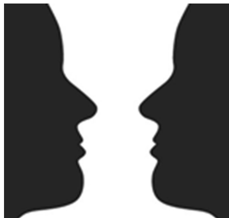
Fig. 3 The face-vase ambiguous figure