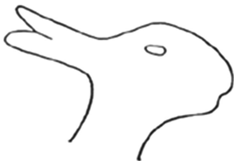
Fig. 1 The duck-rabbit ambiguous figure

A task that has previously been linked to both divergent thinking performance and autism is ambiguous figure reversal. Ambiguous figures are pictures that have two stable percepts (see Fig. 1 the duck-rabbit ambiguous figure). Most people who can see both versions experience reversals, where the percept alternates as the participant views the figure. Previous research has found that young people with high levels of autistic traits see fewer reversals of an ambiguous figure (Best et al. 2007). Developmental work with children with autism also suggests infrequent reversal is characteristic of autism (e.g., Ropar et al. 2003;