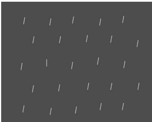
Fig. 1 Example stimulus in target ‘present’ condition

Participants were seated in a height-adjustable chair at 57 cm distance from a 22" monitor. A chin-rest was used to