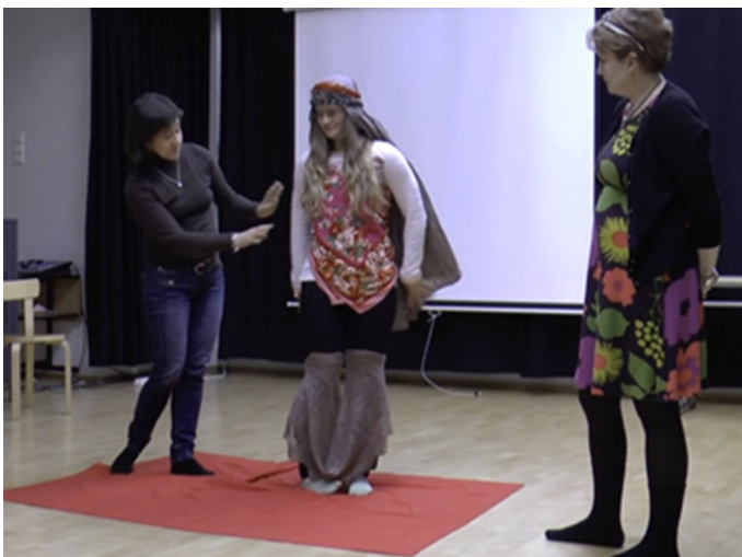
Fig. 2 Student teachers' drama performances

The whole project highlights a DIY and DIWO attitude, participatory practice and constructive creative elements in creating the innovative artefact and its story. It increases engagement on the topic, encourages active participation, blurs the roles of the learner and the instructor and encourages shared learning and creativity (e.g., Lambert 2013; McGee 2015; Niemi et al. 2014; Sadik 2008; Gomez 2015). A salient feature of the applied educational approach is its student-centeredness. In this project, student teachers were