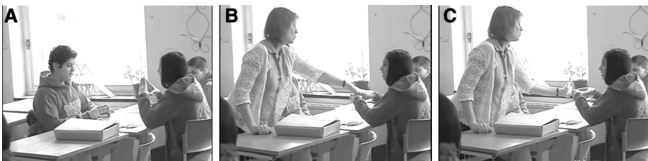
Fig. 4 Student showing the form of a triangle with her hands (a) and teacher asking in which direction it is best to load a triangle (b, c)

In this situation, we also see that the teacher, after providing some crucial input about material properties (conceptual knowledge) using verbal and non-verbal interactions, wants the students to establish common ground by themselves. Lolly-stick stability and triangle stability are two things that the teachers try to establish common ground about. The didactical move the teacher uses in these situations seems to be intended to challenge the students to find out for themselves; the question is whether common ground is established or not. The teacher leaves them but comes back to the group several times during the lesson and asks questions about the stability of the lolly stick.