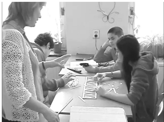
Fig. 3 The bridge path is ready and the students have lolly sticks in front of them that they use when explaining how to build the bridge pillars

4.37 Teacher: A question... have you put aside the ones for the legs [bridge pillars].