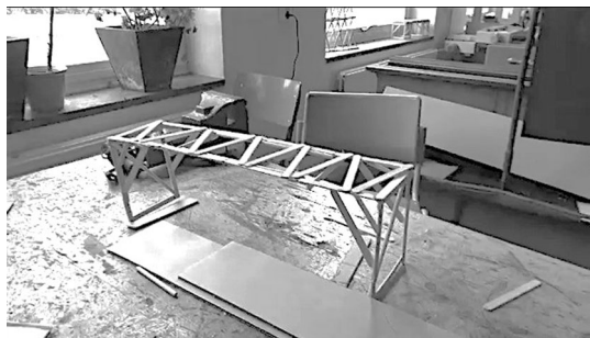
Fig. 6 The bridge model made by the group in focus

We find that the teacher establishes joint affordances and common ground about technological concepts by making didactical moves with regard to how the students can investigate the properties of the lolly stick and how the triangle form can withstand more pressure. However, there is a lack of didactical moves that might help the students to