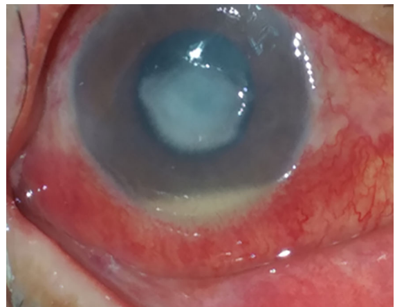
Fig. 2 Fungal keratitis caused by aspergillus flavus with hypopyon