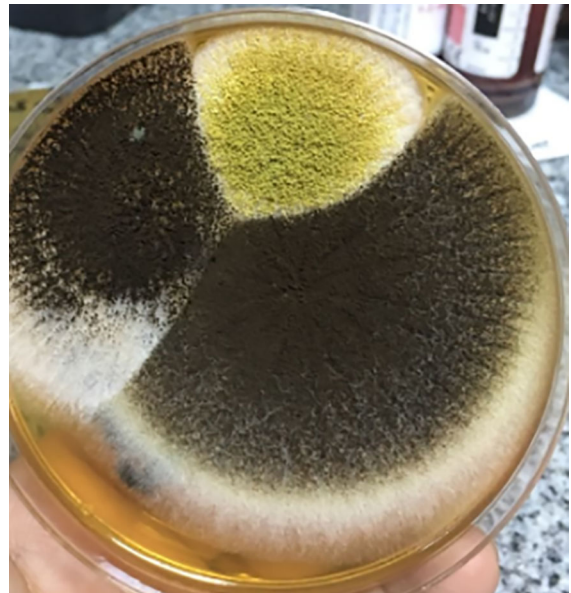
Fig. 1 Aspergillus growth in Sabouraud dextrose agar

After receiving the appropriate treatment for each case according to clinical and microbiological results, the success in outcome of treatment was defined as improvement in signs and symptoms and complete