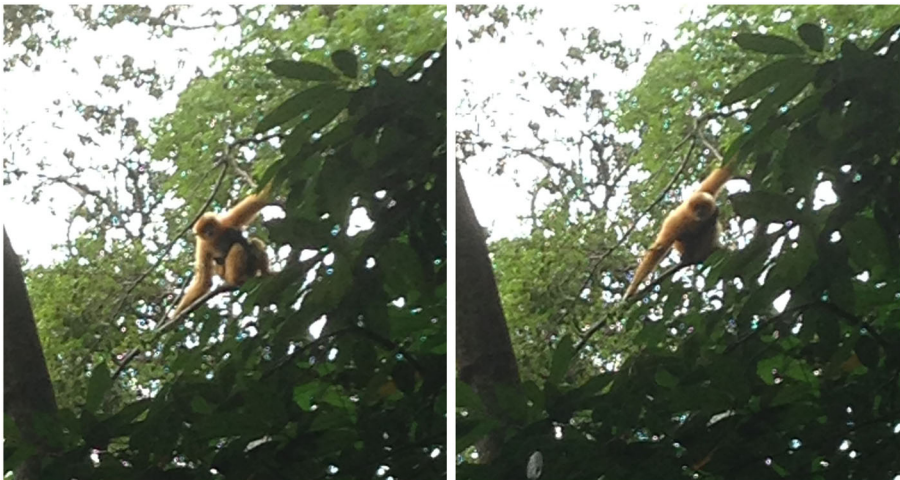
Fig. 2 Female and infant individuals from a fourth, previously unknown Hainan gibbon social group, group D, first detected at Laodian, Bawangling National Nature Reserve, on June 17, 2015.