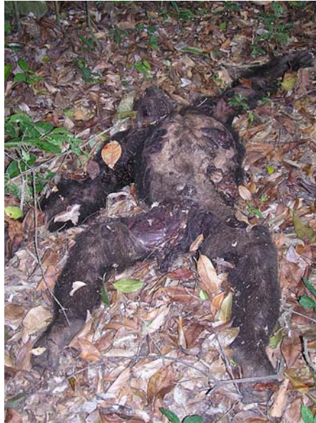
Fig. 2 Fatally attacked chimpanzee. Note the severe injuries to the groin and torso.