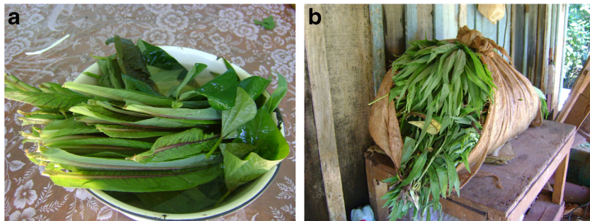
Fig. 2 a) Lactuca virosa and Ipomoea batatas leaves used in salad by Polish descendants in Lanusses, Northern Misiones, Argentina; b) A bundle of Lactuca virosa leaves (Lanusse, 15.03.2011,)

The Saliency Index gave similar results to the Citation Index. Fruits stand out as culturally salient wild food for Polish migrants and their descendants. The most culturally important species are Eugenia uniflora L. (0.698), Eugenia involucrata DC. (0.681), Rollinia salicifolia Schltdl. (0.670), Campomanesia xanthocarpa Mart. ex O. Berg (0.508), Syagrus romanzoffiana (Cham.) Glassman (0.469), etc. The only green vegetable in the first 10 most salient species was Hypochaeris chillensis (Kunth) Hieron. (0.264), in eighth position.