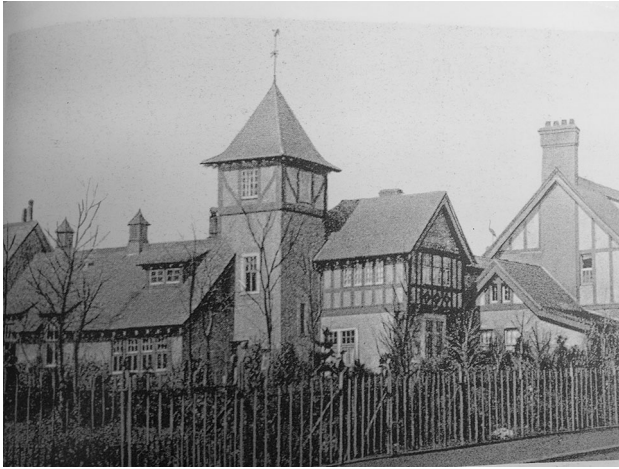
Figure 1. The Bungalow, Penicuik, c.1900.

twentieth century. 7 Other historians focusing on the organisational arrangements and settings for British genetics have demonstrated that, as an emerging scientific discipline, the spaces for genetics research were often domestic and rural rather than metropolitan and institutional (Richmond, 2006; Opitz, 2011). This was partly a result of the fledgling science's arriviste intellectual status and partly the unique spatial and technical requirements of plant and animal breeding experiments (Richmond, 2006, p. 597). Ewart's independent research station pre-figured the "country house" arrangement later adopted at sites such as Whittingehame Lodge in Cambridge and the John Innes Horticultural Institution at Merton Park, Surrey (Opitz, 2011, pp. 80, 90). Yet breeding and genetics in Edinburgh would develop in distinctly different ways. While the latter two centres had their origins in private benefaction, the ABRD would emerge as part of a network of state-supported research institutes (Olby, 1991). This government support would be secured despite the concentration of funds and powerful social networks in the capital and the south-east of England. Moreover, Ewart's work as a zoologist and experimental animal breeder steered the direction of genetics in Edinburgh towards an animal breeding context as distinct from the predominant focus on plant breeding and horti-