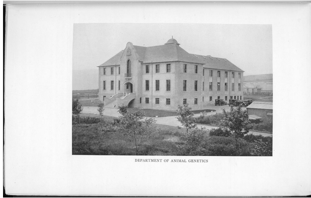
Figure 3. Institute of Animal Genetics building, 1930.

had enlisted in the army that summer, died of cerebral meningitis at Gailes military training camp, aged 37. 76