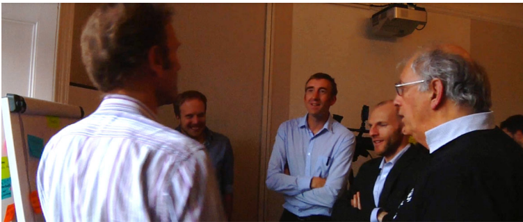
Fig. 4 Playframe ending: Laughter and different participant picking up the point made

the right to speak ‘truth’ to (institutional(ised)) power. The laughter, shared by at least two other group members, that follows his performance constitutes a form of mutual acknowledgement of the felt lack of control and influence over market-driven developers and thereby lends support to the participant (Fig. 4).