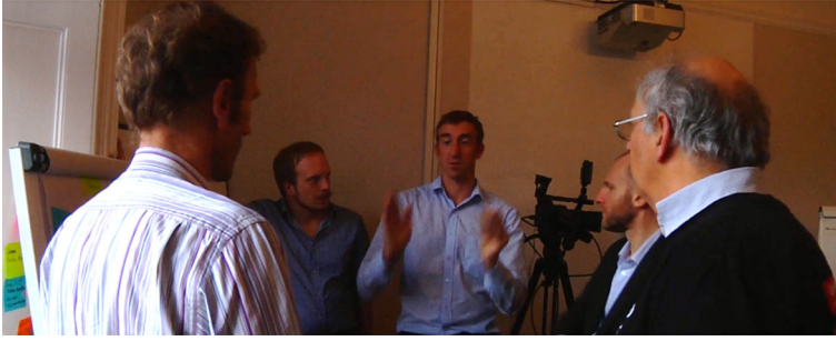
Fig. 2 Playframe opening: Participant starts speaking