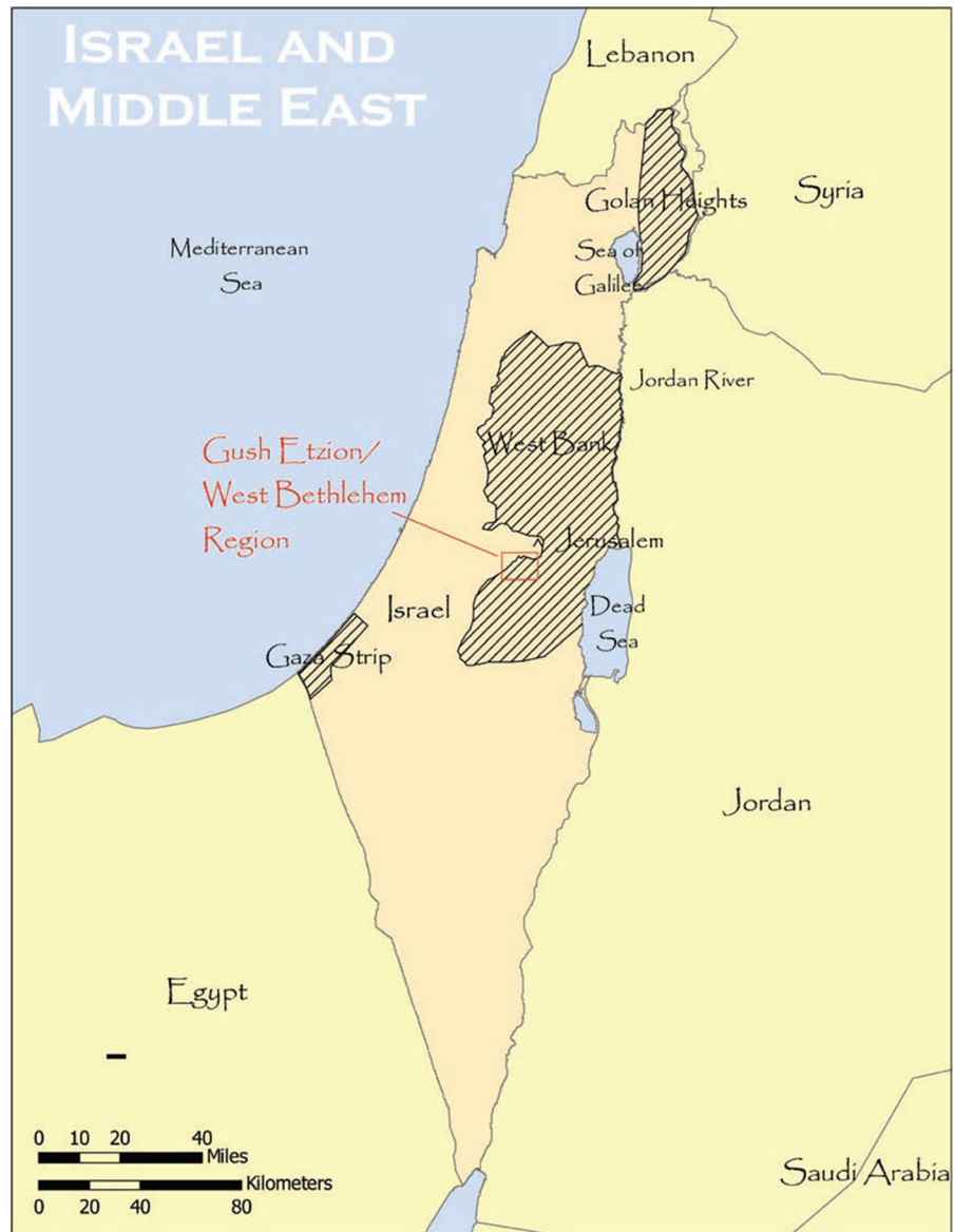
Fig. 1 Map showing the location of the greater Bethlehem area (labelled here as ‘Gush Etzion/West Bethlehem Region’) in Israel/Palestine

‘EcoPeace’). The project, which has leveraged hundreds of millions of dollars, involves the selection of neighbouring communities located on opposite sides of the political divide (Israeli, Palestinian and Jordanian) to cooperate on common water issues. Initially the project included a total of 11 communities but it has since expanded to include 28. The project is an oft-cited example of successful environmental cooperation/peacemaking and has received much praise and attention (e.g. Ide 2014; Kramer 2008; The Butterfly Effect 2014). However, most references to the project have evaluated and analysed it at a general and broad