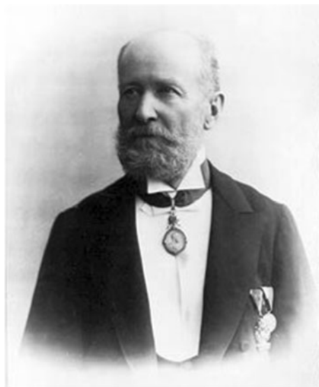
Fig. 1 Károly Than (1834–1908), Professor of Chemistry at the University of Budapest (1860–1908) (from László 2011)

cubic centimetres of a gas under normal conditions. This duality causes the confusion in chemistry. In addition, the fact that Than contributes to the first calculation of the number 6.022 \times 10^{23} \text{ mol}^{-1} is an evident case. In the researcher's opinion, this duality (also this wrong knowledge) in the naming of number 6.022 \times 10^{23} \text{ mol}^{-1} should be given an end and this number should be called only Avogadro's number. In addition, Than's contributions to its first calculation should be acknowledged.