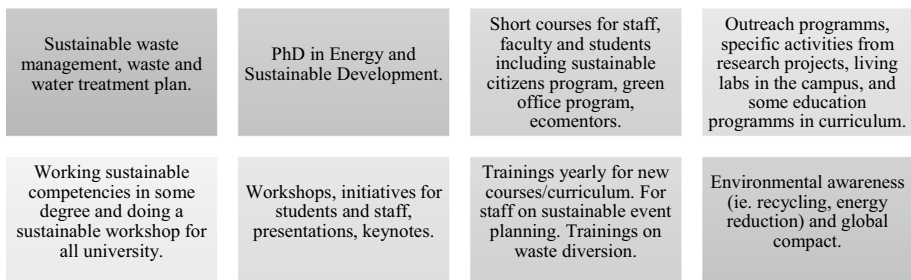
Fig. 3 Programmes or opportunities related to sustainable development offered by the universities

Besides these factors, in an open question the respondents indicated other challenges, such as willingness to contribute, lack of time, lack of political support, and not recognizing the Sustainable Development Goals (SDGs) as a way out. The two biggest