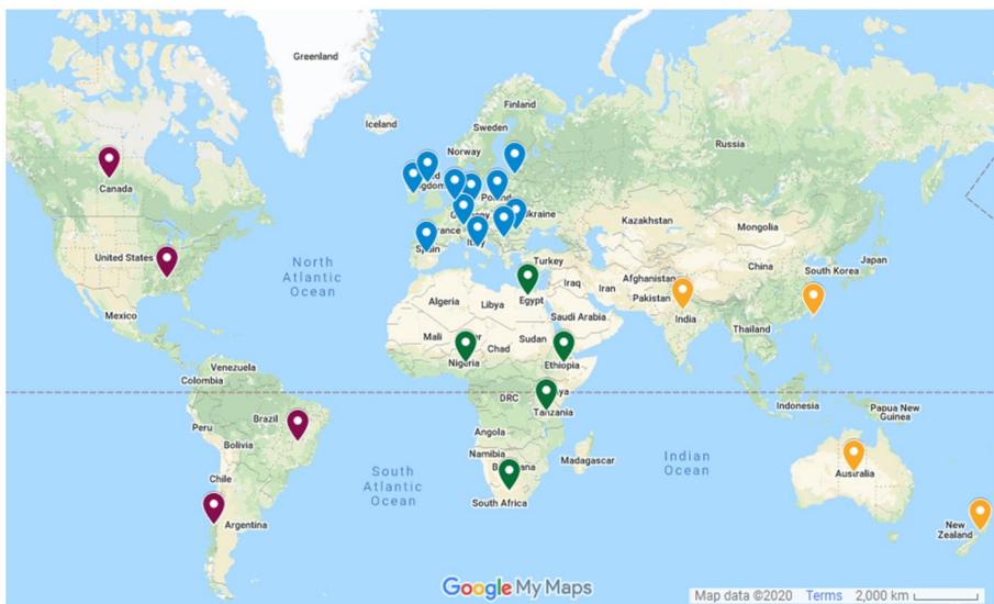
Fig. 1 Countries of the participating universities

The additional space for comments at the end of the survey also provided interesting topics that were brought to the discussions.