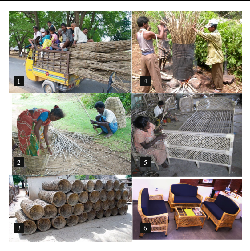
Fig. 1 Lantana user groups (1 Lantana stick collection by Madigas; 2 Lantana basket weaving by Irulas; 3 Lantana basket ready for sale; 4 Lantana sticks boiling by Soligas; 5 Lantana furniture making at MM hills; 6 Lantana sofa)

and furniture (Fig. 1). From the context of human adaptations to biodiversity change (Fabricius et al. 2007) and in this specific context, to IAS, this example offers an opportunity to ask: (a) What are the critical socio-economic parameters that distinguish people or communities that use Lantana (the user group) compared to those who do not (the nonuser group)? (b) What are the key determinants that promote its use by communities? (c) Can such learning catalyse the use of Lantana in other communities and landscapes where the species is abundant? and (d) What are the tangible economic gains to communities in using Lantana ? We discuss these questions in the larger social-ecological context of how local communities have responded to biodiversity changes both spatially and temporally.