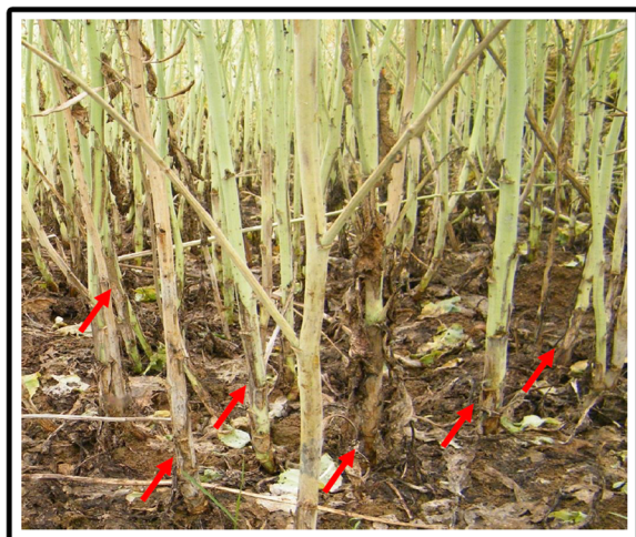
Fig. 2 Symptoms of phoma stem canker on stems of winter oilseed rape in Xiangyang County in Hubei province in May of 2013. Symptoms (red arrows) of stem base cankers and upper stem lesions were observed. The incidence of phoma stem canker was 46.2% plants affected. Ten diseased and 10 healthy plants were sampled to estimate crop yield loss

A total of 311 oilseed rape stems with phoma stem canker (208 stems in 2012, 103 stems in 2013) were used for pathogen identification. For isolation and morphological identification, a total of 141 Leptosphaeria isolates (115 isolates in 2012, 26 isolates in 2013) were obtained. After 10 days of incubation on PDA, all the isolates produced black-brown globose pycnidia with pink conidial ooze, suggesting that they were L. biglobosa . The isolates were further identified to be L. biglobosa by species-specific PCR, in which a DNA fragment of 444 bp was amplified. In nested PCR identification of the pathogens in these 311 diseased stems,