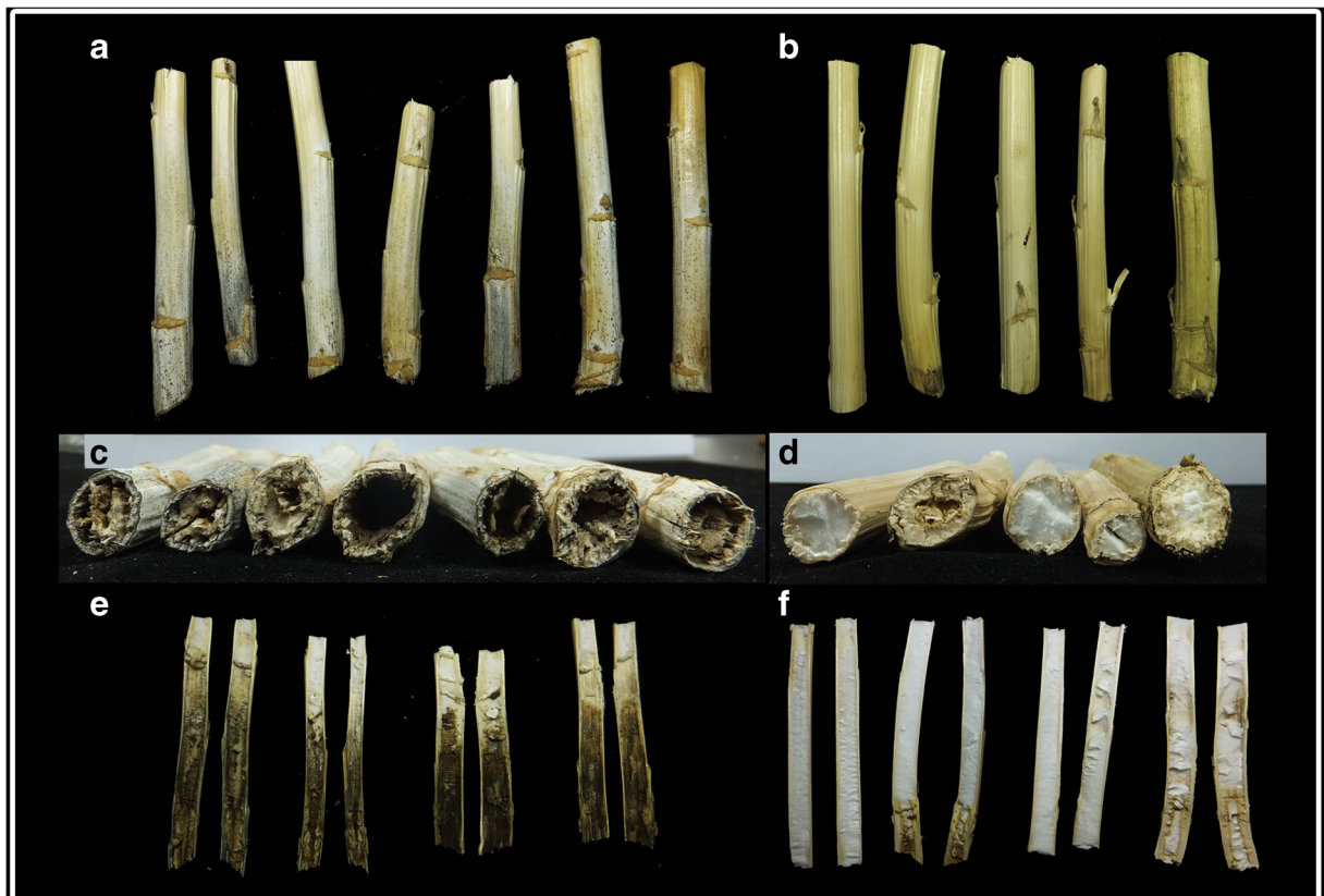
Fig. 4 Symptoms of phoma stem canker on oilseed rape at 74 days after inoculation. External and internal symptoms on stems of oilseed rape cultivar Ningyou 7 inoculated with Leptosphaeria biglobosa (a, c, e) or with water (b, d, f)

the seed yield components assessed. Therefore, the results are presented separately for each experiment. For the experiment, in the 2011–2012 season, the number of seed/pods and yield/plant for all three cultivars were