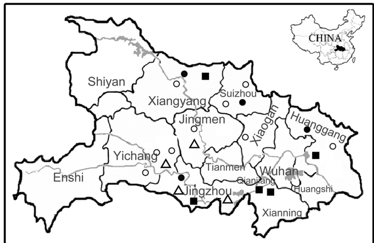
Fig. 1 Sampling sites for the phoma stem canker survey on winter oilseed rape crops in counties in Hubei province, central China. ‘○’: sites for disease survey only in May 2012; ‘■’: sites for disease survey only in May 2013; ‘△’: sites for disease survey in both seasons; ‘●’: sites for disease survey and yield loss assessment in both seasons

presence of Leptosphaeria pycnidia. They were cut into small pieces (about 0.5 \times 0.5 cm). Each stem piece was divided into two. One half was used for pathogen isolation and identification by morphology/pigment observation and PCR confirmation. The other half was used for direct DNA extraction and identification by nested PCR without isolation.