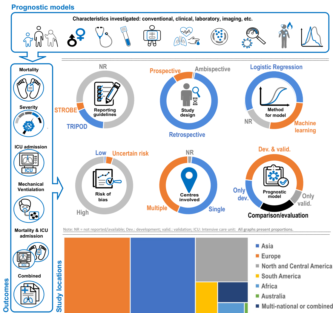
Fig. 2 Visual summary of the findings on evaluated prognostic models

suffering from many methodological issues including limitations in model development, presentation and being incompletely or inadequately reported. Thus, the polarized focus on limitations and methodological challenges that emerged from this report serves as a reminder that current prognostic models on COVID-19 severity, have limited applicability and require caution before implementation in routine care in the clinical setting. In addition, models were concentrated in specific regions, as they were developed and validated predominantly in China and Europe. Hence, there is a need to develop models tailored to other countries before generalization and application.