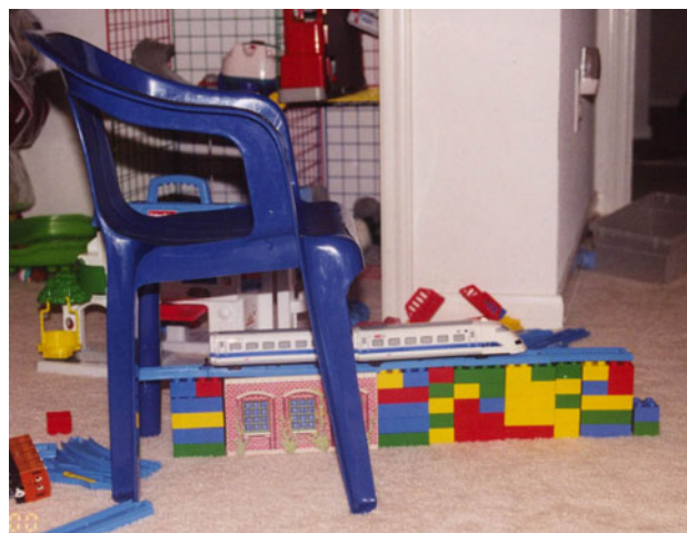
Fig. 2 Tom's creation of a tunnel and a trestle

As with the planning web (Fig. 1), Tom's mother gradually introduced various sub-themes related to trains (e.g., conductors, passengers, tunnels, stations, and railroad crossings) through pretend play. She started adding recycling materials, such as an empty tissue box for a train station, a toilet roll for a passenger or a building, a trash bag for a river, and an old chair for a tunnel. Not only did Tom learn to collaborate with an experienced player like his mother, but he also started spontaneously using divergent materials to create his set-up. In Fig. 2, he used a blue chair as a tunnel and also made a trestle with Lego blocks to support his train roads. Putting the various materials together to make his own train system was an investigation, which required a complex understanding of weights, space, heights, and gravity. Thus, using divergent materials for