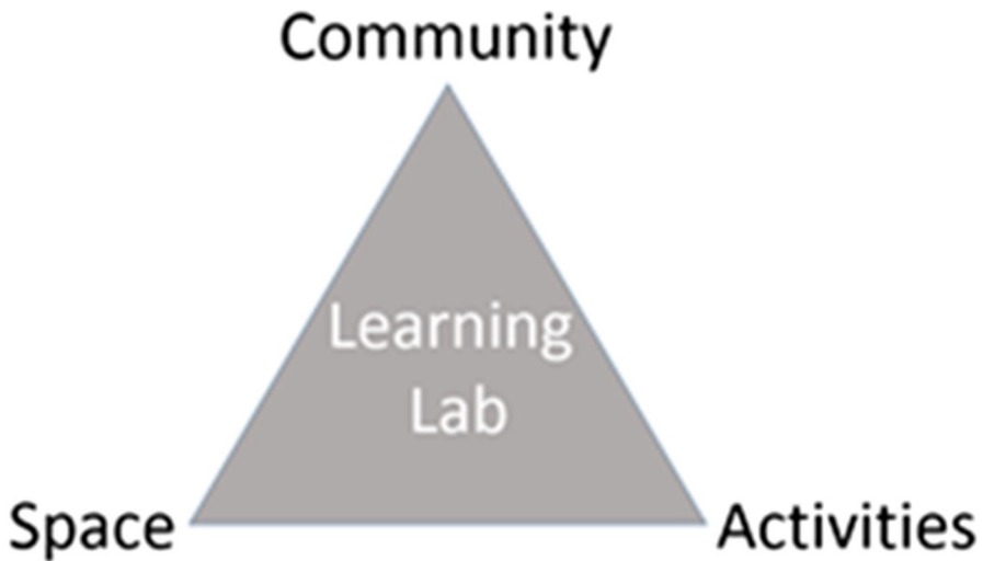
Fig. 2 The learning lab as a 3-dimensions model

The 3 dimensions are not isolated. They interact so that each dimension is impacted by the choice made for the design and implementation of the two others dimensions. This leads to the fact that each decision taken in terms of design and implementation should be based on a systemic approach.