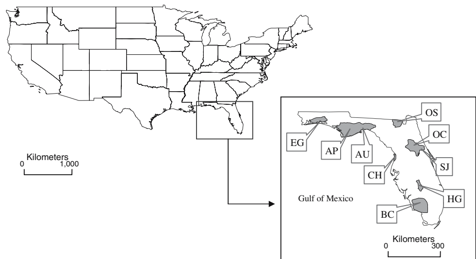
Fig. 1 Geographic distribution of the Florida black bear populations in Florida. Populations are: Eglin (EG), Apalachicola (AP), Aucilla (AU), Osceola (OS), Ocala (OC), St. Johns (SJ), Chassahowitzka (CH), Highlands/Glades (HG), and Big Cypress (BC). The distribution map was compiled by the Florida Fish and Wildlife Conservation Commission

Fragmentation of populations can reduce genetic variation (Sherwin and Moritz 2000), gene flow (Vos et al. 2001) and increase the probability of extinction (Saccheri et al. 1998; Westemeier et al. 1998), but the genetic consequences of habitat fragmentation on Florida black bear populations are unknown. Using microsatellite analyses, our objectives were to estimate within-population genetic variation, and to investigate the level of genetic differentiation among populations. Theory predicts a positive correlation between genetic variation and population size (Frankham 1996), and between genetic differentiation and geographic distance among populations (Slatkin 1993). Thus, we tested these predictions by examining the relationship between measures of genetic variation and recent