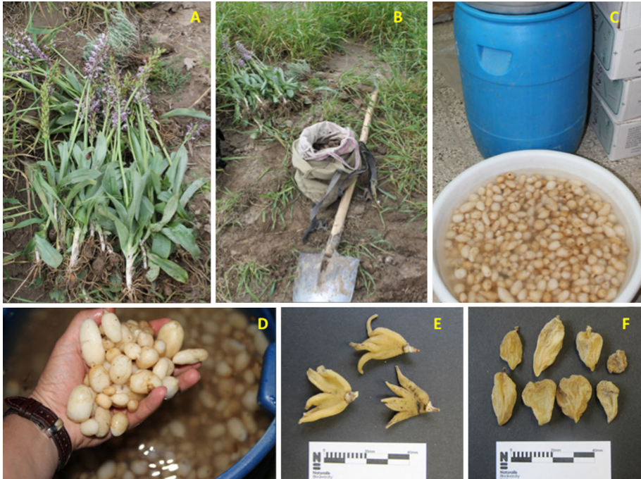
Fig. 2 Orchid collection and drying in Iran. a, b Plants of Orchis simia thrown away after harvesting fresh tubers; c, d Fresh tubers are kept in water after the soil is washed away. Different sizes of the tubers represent different species; e Dried palmate Salep from Dactylorhiza tubers; f Dried ovoid Salep