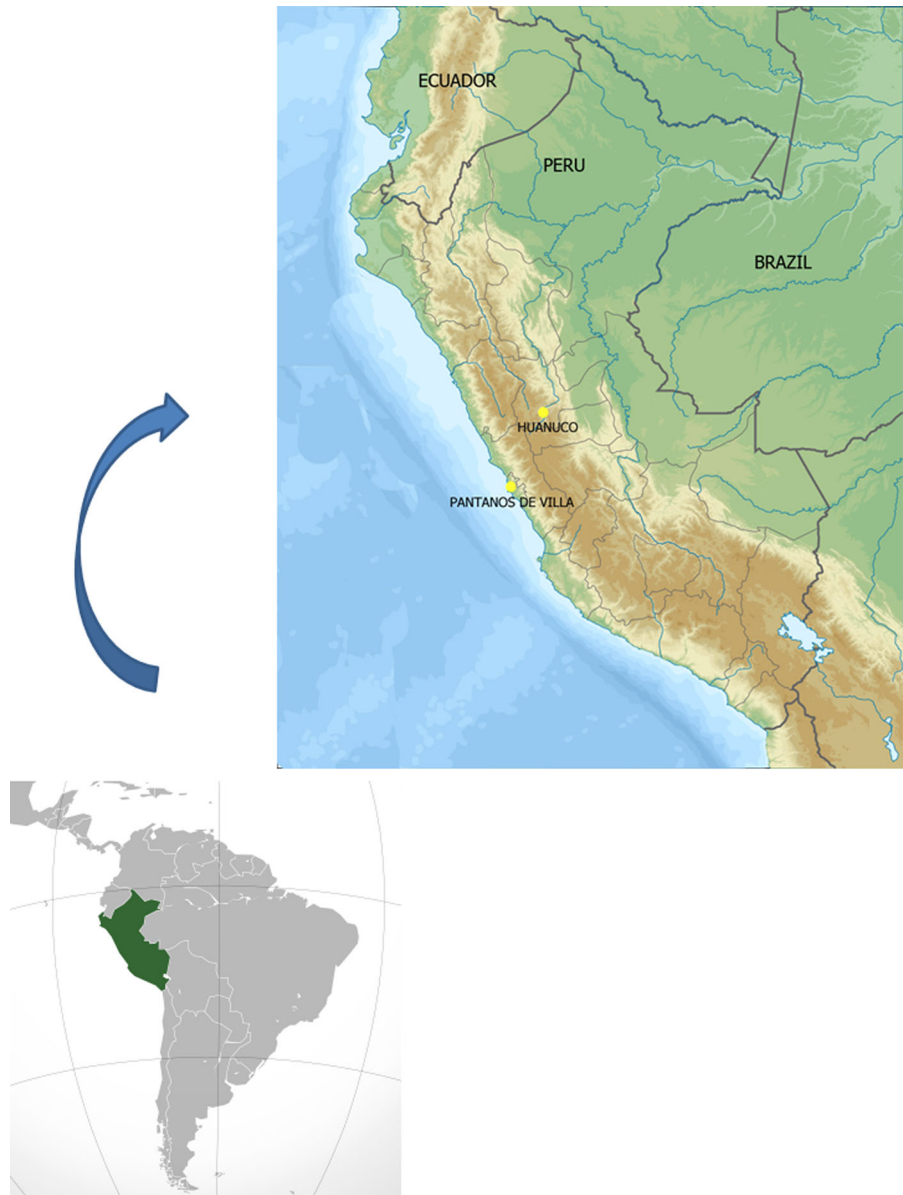
Fig. 1 Collection sites in Peru

For all these reasons, the International Union for Conservation of Nature (IUCN) classifies avian malaria P. relictum to be among the 100 of the world's worst invasive alien species (Lowe et al. 2000). Hence, the identification of the geographical distribution of P. relictum lineages and their infection prevalences in birds has become essential in order to develop appropriate management strategies to facilitate biodiversity conservation efforts worldwide. Here we analyze the presence of pSGS1 in Neotropical birds from two different areas of Peru; Lima and