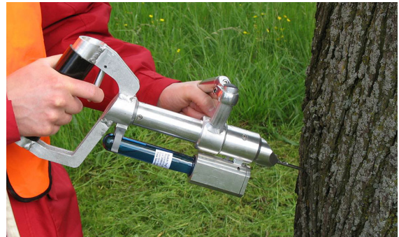
Fig. 1 Hand held tree injection system: the chisel is pushed through the bark, by pulling the trigger a drop of the vaccine is released which subsequently will be taken up by the elm trunk

Trees were injected (vaccinated) with Dutch Trig ® once a year in spring, as soon as the leaves had started to sprout after flowering of the elm. The best timing of the injections is at 25 % leaf expansion. For the Netherlands as well as North America vaccination usually started the first or second week of May and the second week of June vaccinations were finished. The vaccine was injected into the tree trunk at a height of 1.3 m, every 10 cm of tree circumference, by pushing the chisel through the bark and releasing one drop (0.15 ml) with one pull of the trigger (Fig. 1). The injection system prevents spills and any impact on plants, trees or animals in the environment. The