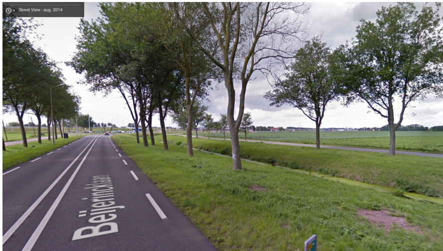
Fig. 3 Untreated susceptible elms with DED infection ( white cross ) along the provincial road ( left ) and Dutch Trig ® treated elms along the street at the other side of the ditch in Waddinxveen (Google street view, August 2014)

in treated trees was even reduced to approximately 0.6 %. Also in areas with a strict and coordinated sanitation program during a prolonged period, low infection levels of 1 % or less can be reached (Anonymous 2015; Bleeker and Kaljee 2013, 2014). However, unknown numbers of resistant elm trees positively influence this infection percentage. In the few locations where Dutch Trig ® injected and untreated elms have both been monitored, the infection percentages of the treated trees are always lower, although a statistical significance could not be calculated.