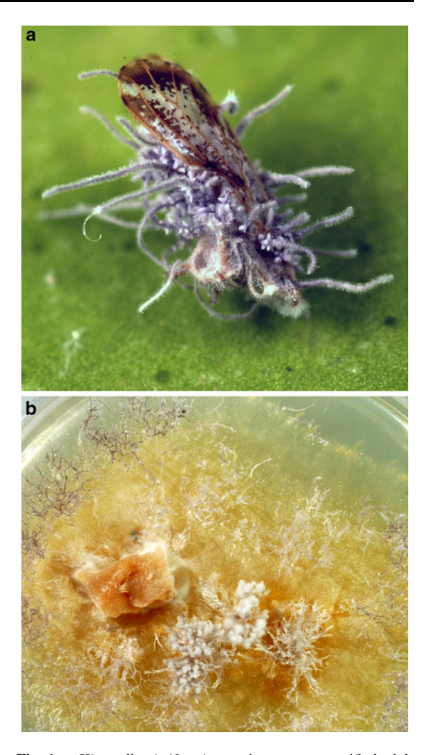
Fig. 1 a Hirsutella citriformis growing on a mummified adult Diaphorina citri (note the synnemata extending from the cadaver). b The same H. citriformis isolate growing on mycological media after approximately five weeks (note the production of well-developed, dark synnemata at the periphery of the culture)

Air temperature and relative humidity data during the two-year study were obtained hourly using a data logger (WatchDog Model 100-T/RH, Spectrum Technologies, Inc., Plainfield, IL, USA) placed inside the canopy close to the trunk of one tree in the grove. Hourly rainfall data were obtained 0.4 km from the study site with a rain gauge operated by the Florida Research Center for Agricultural Sustainability. The environmental variables were summarized for four time periods relative to a sample date: 7 or 60 consecutive days preceding a sample date (no temporal lag), or 7 or 14 consecutive days ending seven days before a sample date (seven days temporal lag). For each of the time periods, summary environmental variables for correlation analyses were calculated based on either averages [e.g., average relative humidity and average temperature] or summations