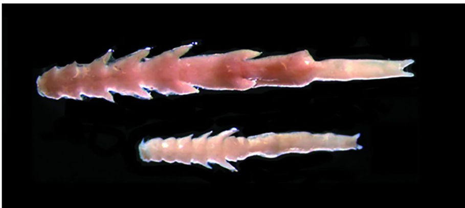
Fig. 1 Image of Mytilicola orientalis . A female is shown above, a male below (Goedknecht et al., 2018)

Nowadays, the genus Mytilicola is classified in the family Mytilicolidae. In addition to Mytilicola spp., this also includes the genera Cerastocheres , Pectonophilus , and Trochicola . As with Mytilicola spp., these genera are parasites. The complete systematics of Mytilicola orientalis is: